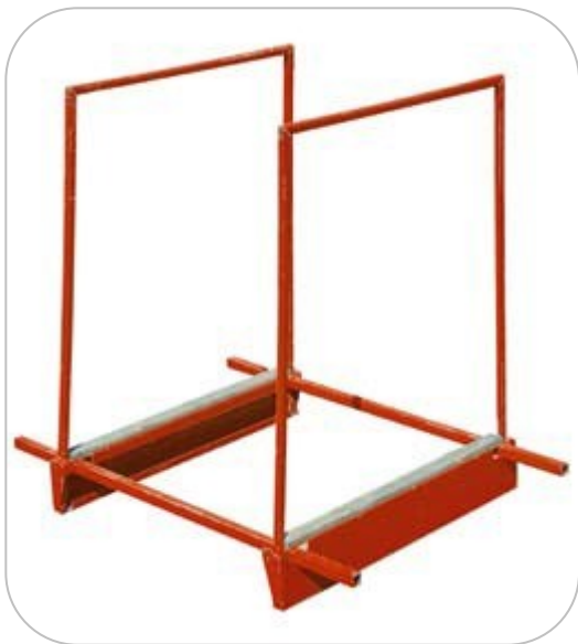
Stable steel and tube construction.