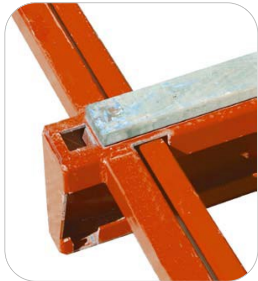
Wearing surface of anti-rot treated wood.