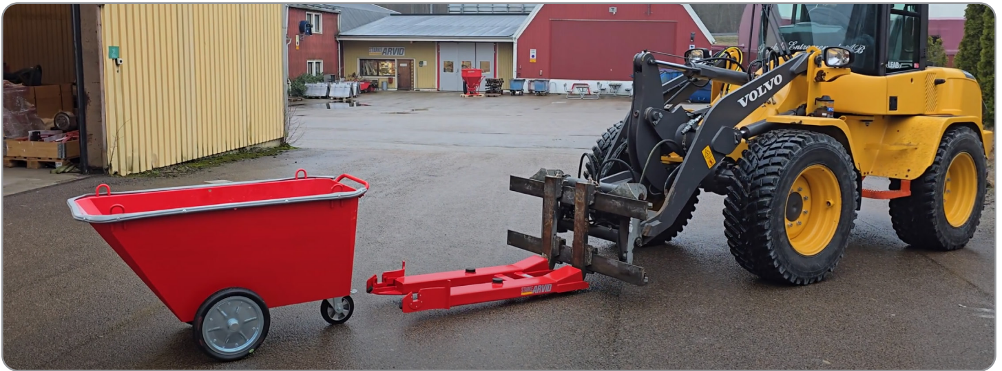
Sorting and emptying the wastebins is easy with the Waste Bin Tipping Frame. Tilt the machine's lifting forks, and the tipping frame gently tips forward to empty the contents.