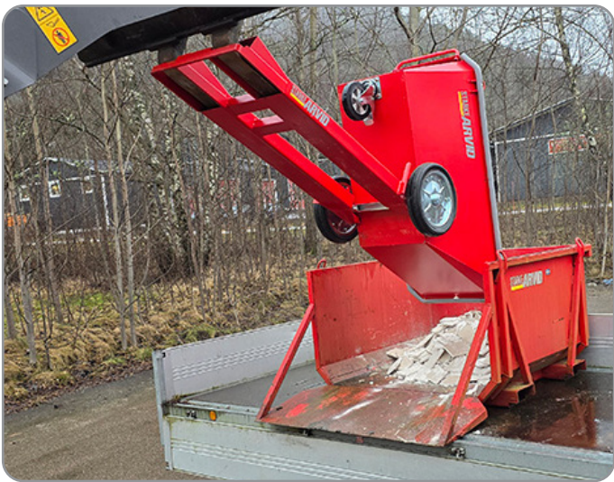
Sorting and emptying the wastebins is made easy with the Waste Bin Tipping Frame. Tilt the machine's forks, and the tipping frame tilts forward to empty the contents.