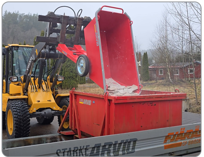
Easy waste disposal thanks to the smooth emptying of the wastebins using the Waste Bin Tipping Frame.