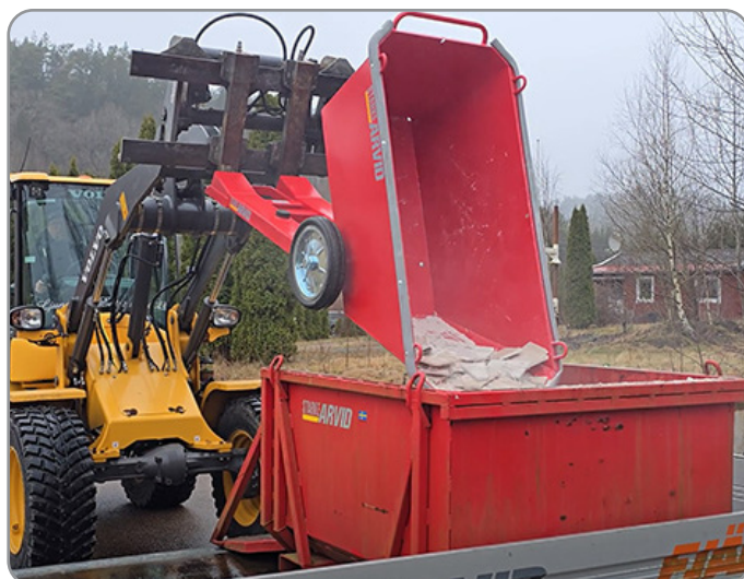
Easy waste disposal thanks to the smooth emptying of wastebins using the waste bin tipping frame.