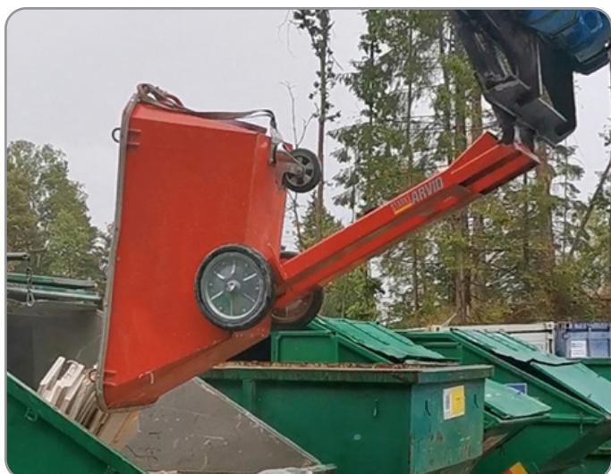
Sorting and emptying the wastebins is easy with the waste bin tipping frame. Tilt the machine's lifting forks, and the tipping frame gently tips forward to empty the contents.