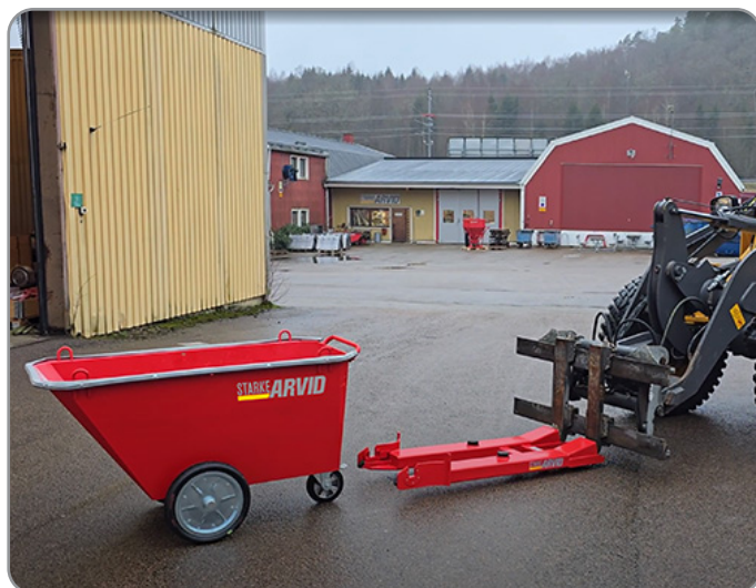
The waste bin tipping frame is driven in under the wastebin to lift it up. It locks securely around the wastebin's wheel axle.